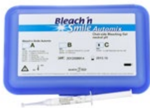
After Bleaching Care Cream Remineralization and desensitization of the teeth