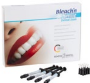
Dental Dam for safe protection of the gingiva