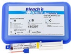
Bleach'n Smile Gel 35 % hydrogen peroxide content after mixing